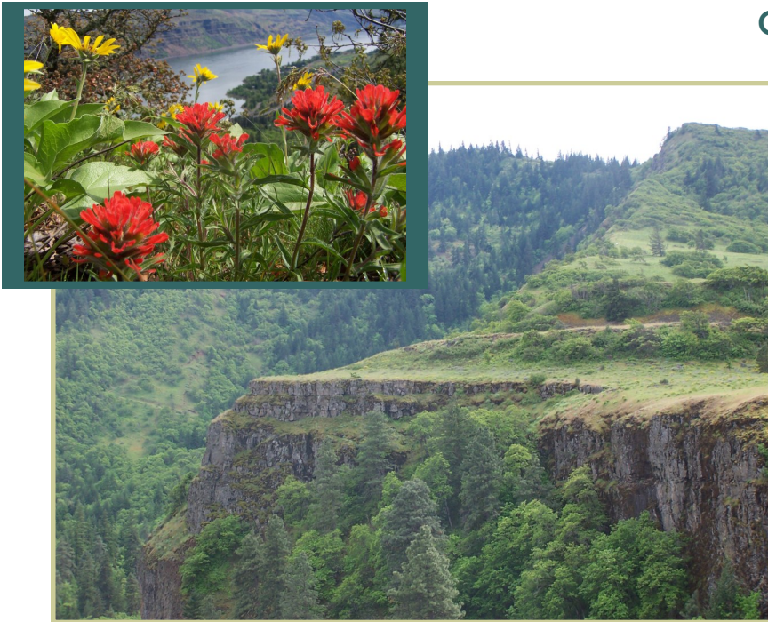
McCall Point