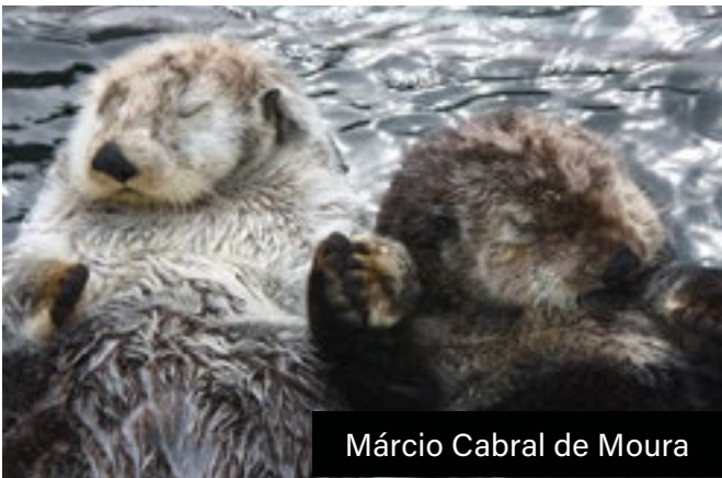
Márcio Cabral de Moura